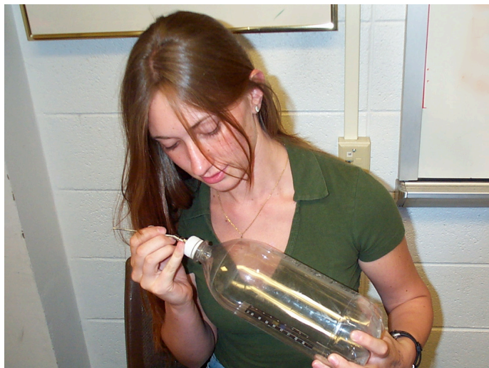
Watching the temperature change as the air expands.

As a rising parcel of air moves into regions of lower pressure, it expands. And as it expands, it cools. The air has to do work to expand, and so its temperature must decrease—the only possible source of energy for the work of the expansion is the thermal energy of the gas. For the large air masses that move in the