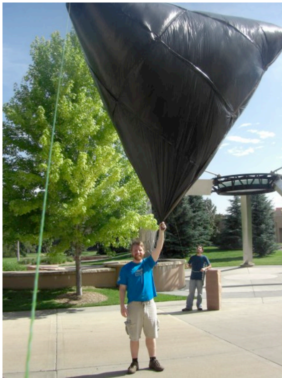
The 16-bag version of this balloon is bigger and liftier.

The most important thing is to make the bag really, really light. So use cheap thin bags and the lightest strongest tape you can find!