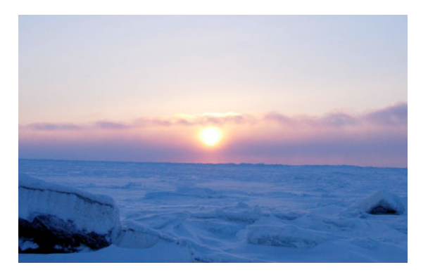
Most of us would associate a scene like this with dawn or dusk. This photograph, however, was taken at 10 am on a summer day in Barrow, Alaska

A low intensity for 24 hours still does lead to a significant amount of incoming energy. In fact, the total en-