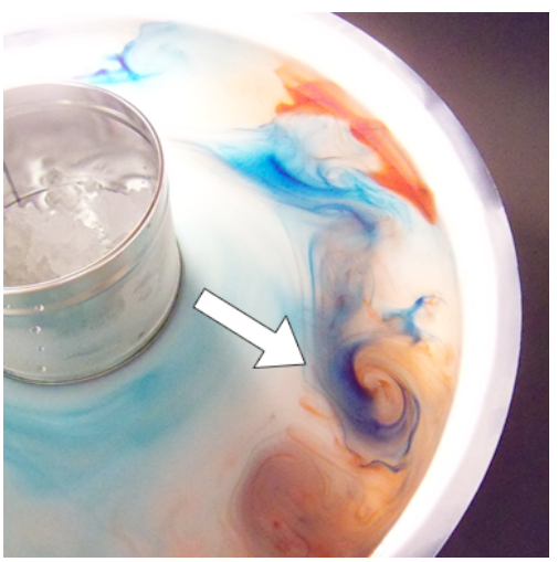
A spinning "storm" forms.

Ask your students to gather around and observe. Gently fill the ice container and place a few drops of blue food coloring at its edges. Add a few drops of red along the outer edge of the pan. The food coloring will allow your students to see the motion of the fluid: red for the warm "air" at the equator and blue for the cold "air" at the North pole. Watch the simulation begin to develop and point out anything of note to your students. You will notice that the hot and cold "air" don't tend to mix but instead travel under or over one another.. If set up carefully, this simulation can run for several minutes and simulate many different atmospheric phenomenon: the jet stream, the doldrums, the trade winds, warm and cold fronts as well as hurricanes.