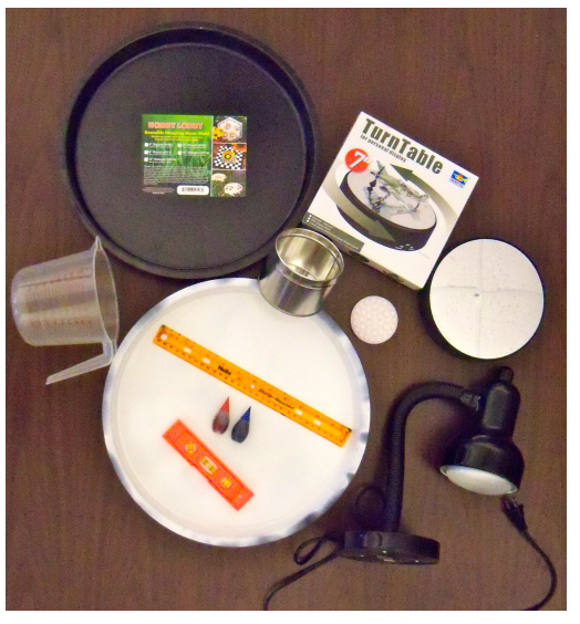
Necessary equipment for this experiment.

Such phenomena are difficult to visualize since they occur on such a large scale. This activity will allow your students to bring these concepts down to a more manageable size as they watch weather phenomena develop on the tabletop in a very simple system that is complex enough to simulate much of the complex behavior of moving air in the earth's atmosphere.