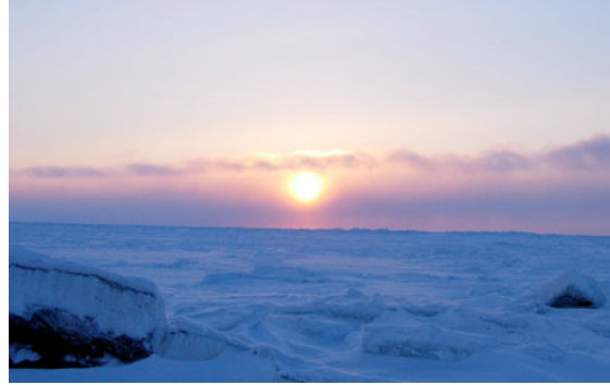
Most of us would associate a scene like this with dawn or dusk. This photograph, however, was taken at 10 am on a summer day in Barrow, Alaska

Little Shop of Physics: http://littleshop.physics.colostate.edu