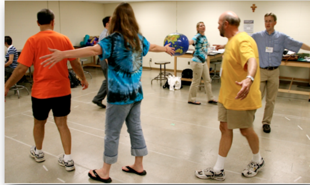
Participants rotating clockwise around a high pressure system.

Try several scenarios. Tell them that now there is high pressure at the center of the circle and low pressure outside the circle. (Have them turn around to face outward so they're not walking backwards). Ask them how they should move. (Clockwise!) Have them act this out for storms in the Southern Hemisphere. What would be different? (The Coriolis effect would now act 90 degrees to the left! ) What would be the same? Have them act this out. In each case, keep track of the direction of movement.